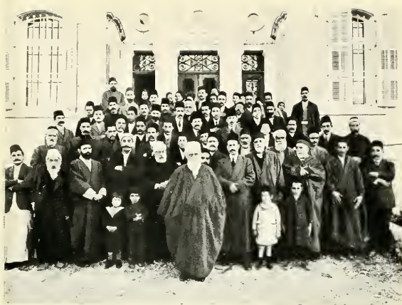
ABDUL BAHÁ WITH SOME OF HIS ORIENTAL FRIENDS AT HIS HOME IN HAIFA